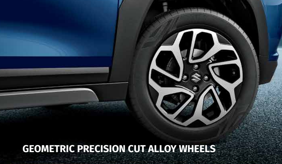
GEOMETRIC PRECISION CUT ALLOY WHEELS