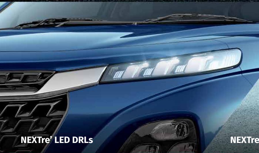
NEXTre' LED DRLs