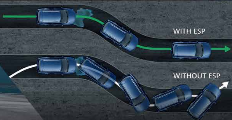
ELECTRONIC STABILITY PROGRAM