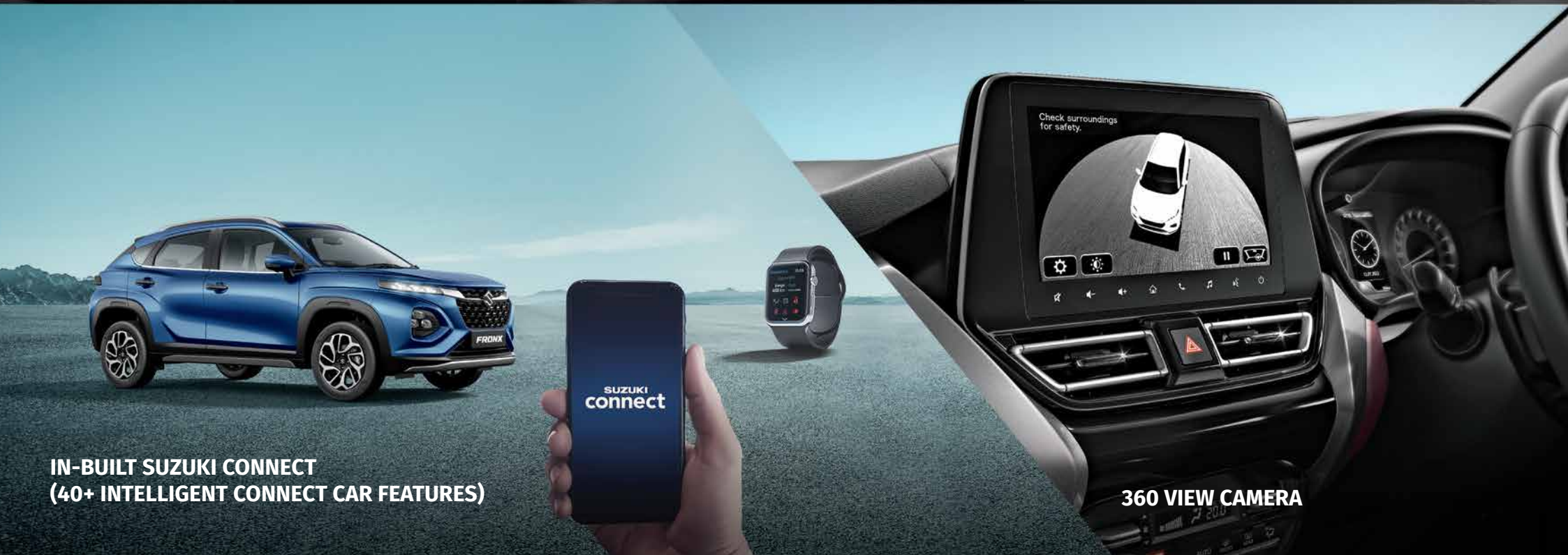
IN-BUILT SUZUKI CONNECT (40+ INTELLIGENT CONNECT CAR FEATURES)