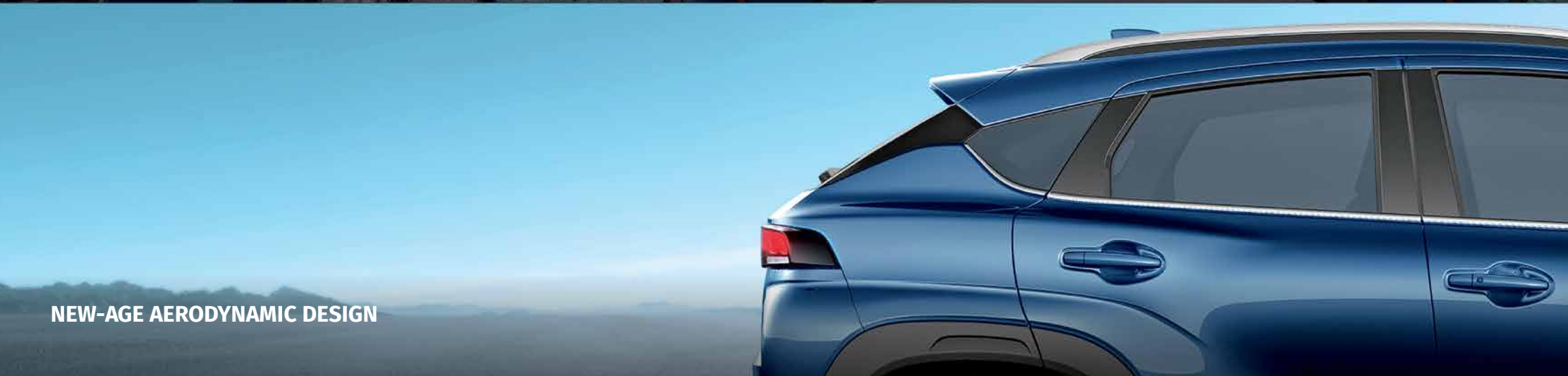
NEW-AGE AERODYNAMIC DESIGN