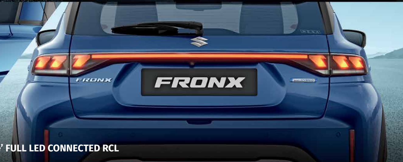
NEXTre' FULL LED CONNECTED RCL