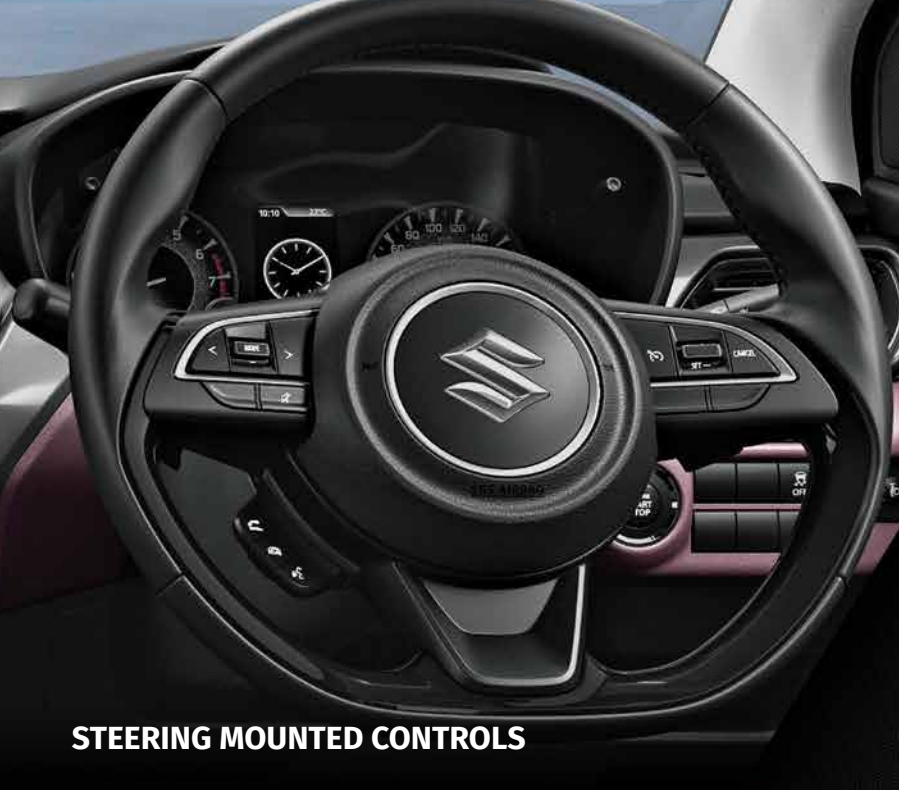
STEERING MOUNTED CONTROLS