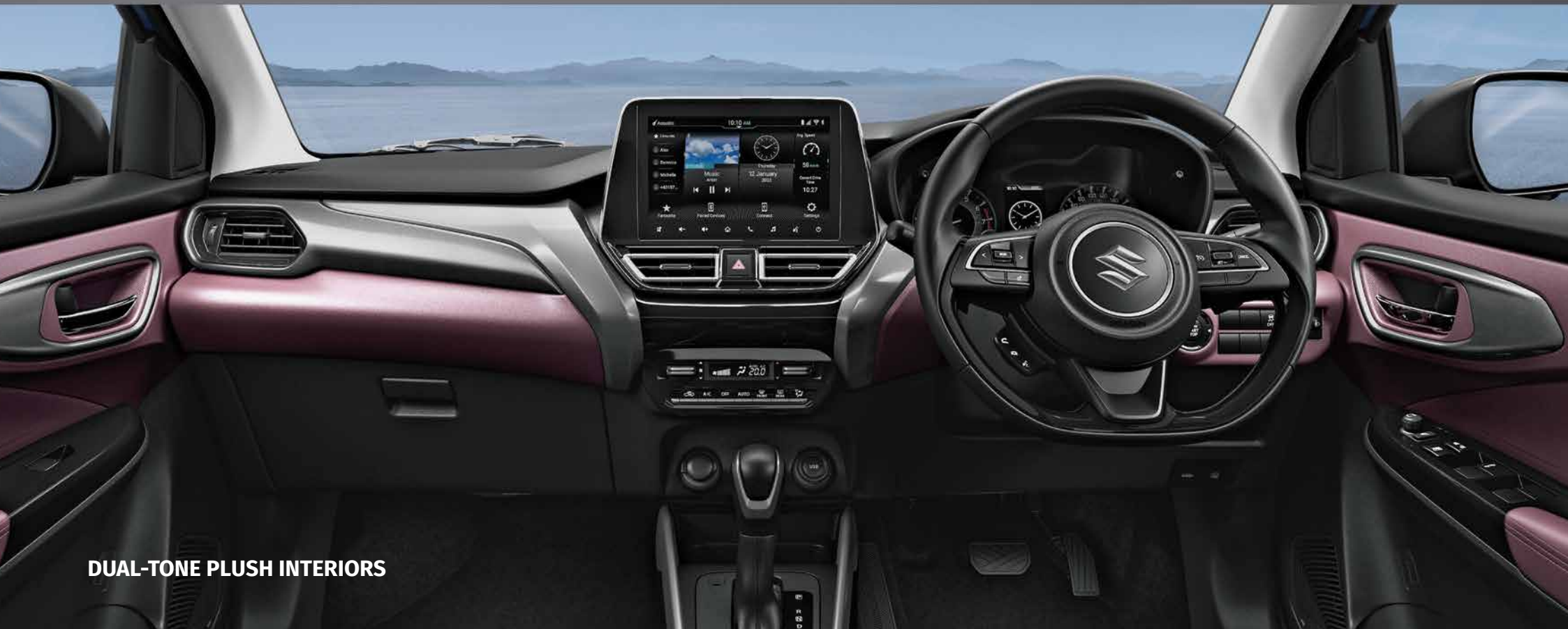
DUAL-TONE PLUSH INTERIORS

From the moment you step in, FRONX enhances the SUV experience with its structural precision and integrated function. The dual-tone dashboard with special forged metal finish and accents seamlessly connects the steering, infotainment system and rounds off the interiors in style. Cruise control and steering-mounted controls ensure you never have to take your hands off the wheel. What amps up the luxury for you, and yours, are details like the driver armrest; rear AC vents; and rear fast charging.