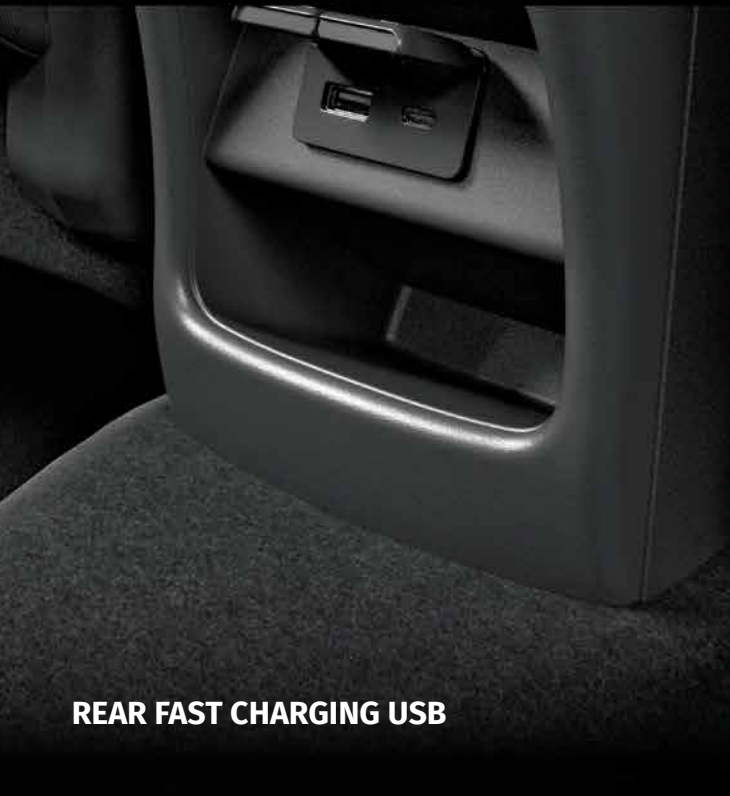
REAR FAST CHARGING USB