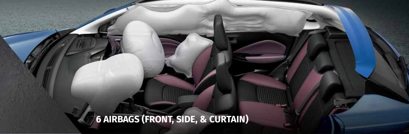
6 AIRBAGS (FRONT, SIDE, & CURTAIN)