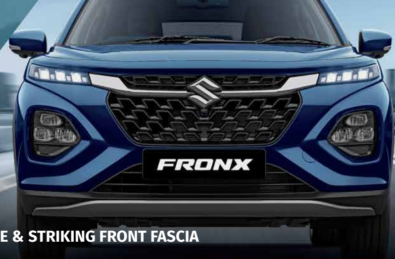
NEXWave GRILLE & STRIKING FRONT FASCIA