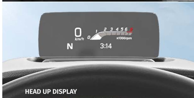
HEAD UP DISPLAY