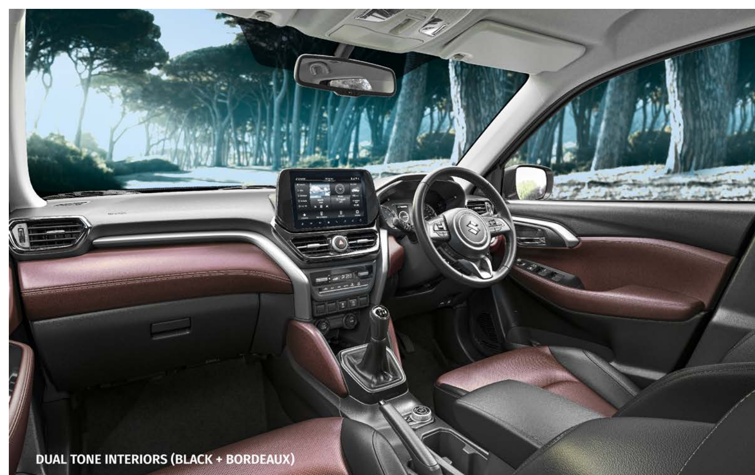
DUAL TONE INTERIORS (BLACK + BORDEAUX)