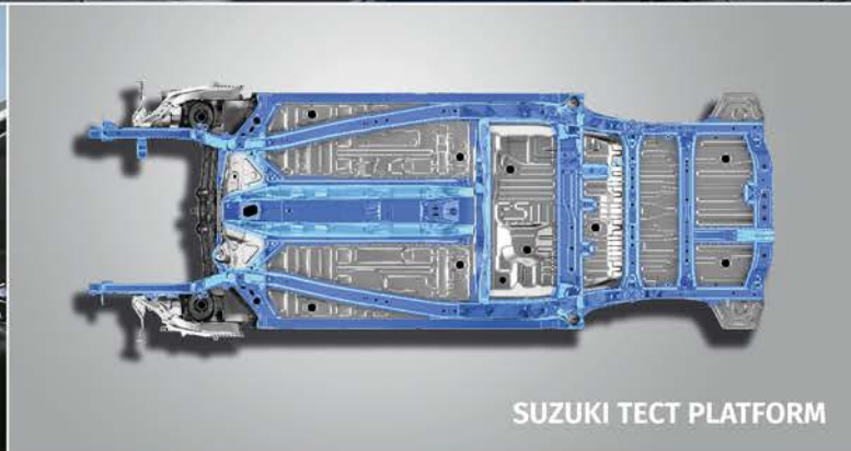
SUZUKI TECT PLATFORM