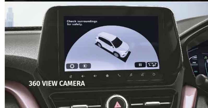
360 VIEW CAMERA