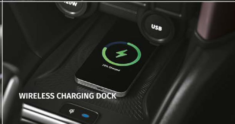
WIRELESS CHARGING DOCK