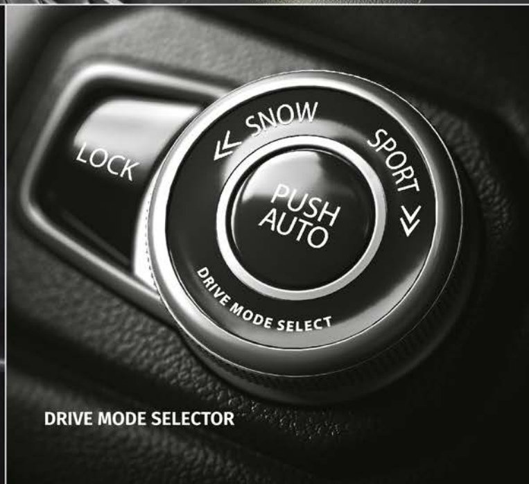
DRIVE MODE SELECTOR