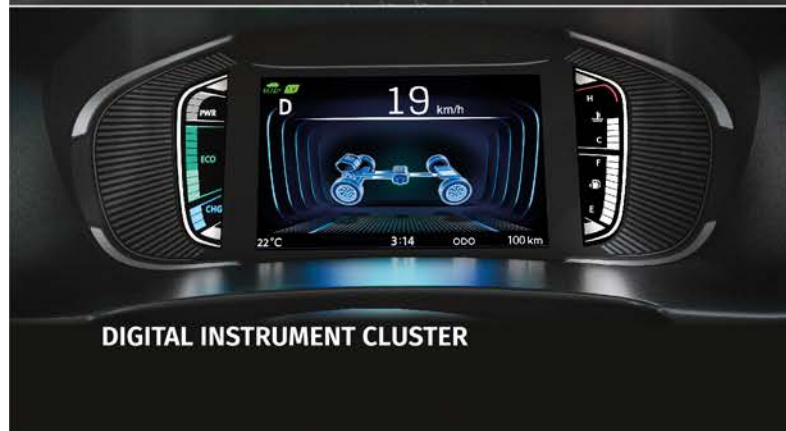
DIGITAL INSTRUMENT CLUSTER