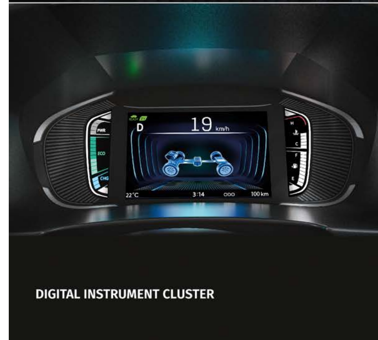
DIGITAL INSTRUMENT CLUSTER